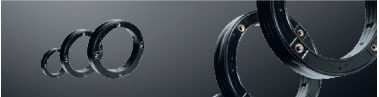
Damping ring type DT